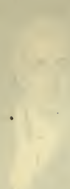
Portrait of [Name] [Title]